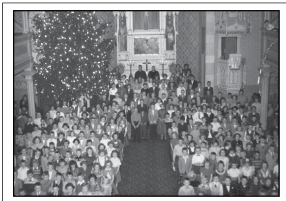
Large, real trees decorated our church through the 1900's. Many students might actually remember sitting underneath the tree during Christmas Eve services, as shown here in this photo from 1951.

As we enter the church the strong smell of pine from the Christmas makes us forget the musty smell. The bright lights