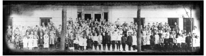
St. Mark's students and teachers, circa 1910